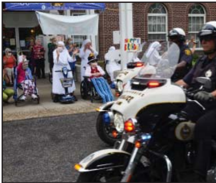
Pittsburgh Motorcycle Police lead the parade.