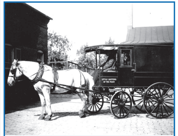
The Little Sisters horse and wagon that was used in the early days for collecting.